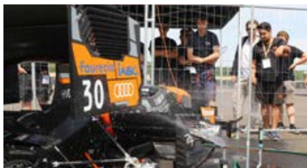
AN ELECTRIC SCRUTINEER HAS TO SUPERVISE THE RAIN TEST