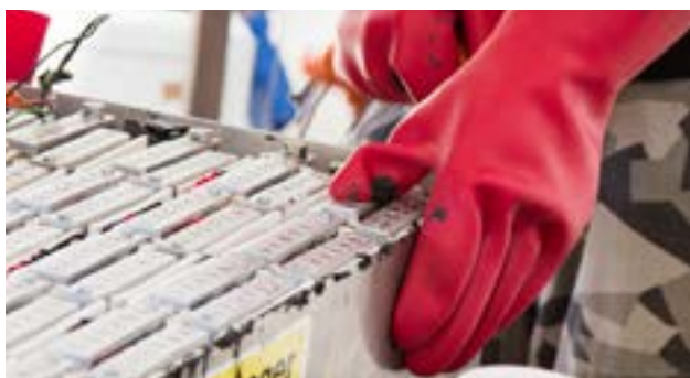
DURING BATTERY CHECK YOU MUST ALWAYS FOCUS ON SAFETY