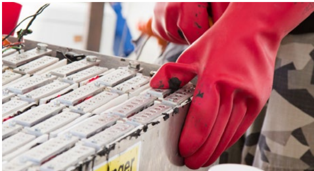
DURING BATTERY CHECK YOU MUST ALWAYS FOCUS ON SAFETY