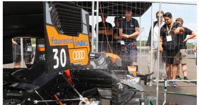
AN ELECTRIC SCRUTINEER HAS TO SUPERVISE THE RAIN TEST